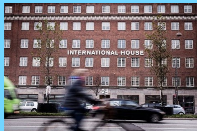
International Citizen Service East Copenhagen

You need to have a place to live with a valid address, and, as mentioned above, you must have a residence permit or certificate. If you don't have a permanent address just yet, ask the staff if you can use your current one, like a hotel, hostel, or Airbnb.