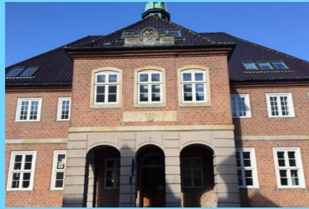
International Citizen Service North Aalborg

If you're unsure at any point in the process, ask the staff for help. They're there to assist you and are usually very supportive if you politely ask for guidance with the forms, procedures, or any specific requirements for your city or municipality.