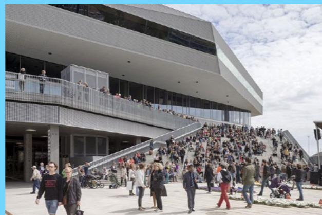
International Citizen Service West Dokk1, Aarhus

We know that the "proof of address" can be the biggest hurdle to overcome. For help finding housing or securing a valid address, see Chapter 5.